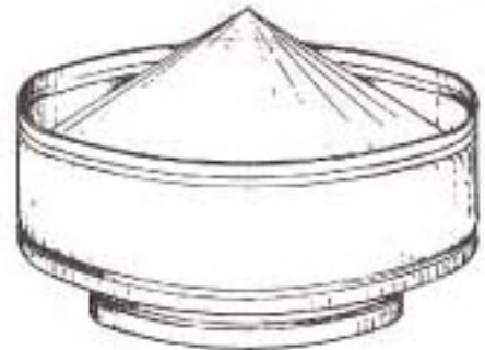
DIMENSIONS OF EVECO VENTILATORS